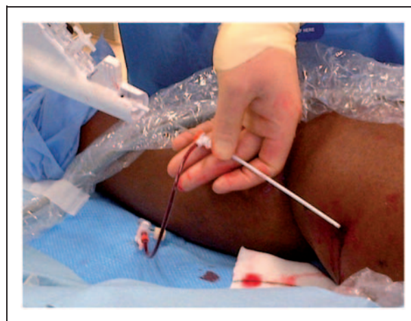
Figure 2. Clinical picture of ClariVein mechanochemical ablation device in use.

improved – 24.82 (5% deterioration) – however, the EQ-5D 0.735 (10% improvement) and EQ-VAS of 80 (14% improvement) were both markedly improved and his VCSS score was improved to 12 (25% improvement). Repeat venous duplex ultrasound at 3 months showed successful SSV occlusion and a competent deep venous system.